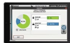
Vacuum/Leak Test Screen fully customizable options allows the user to personalize the times of vacuum and leak testing