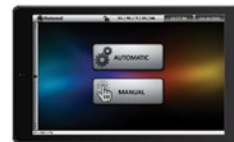
Home Screen allows for quick touch selection of options