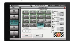
Maintenance Screen offered only to authorized service technicians allowing for quick and easy diagnosis