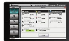
Status Screen for quick reference of resources