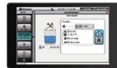
Tank Fill Screen allows for visual, real time progress of tank filling process