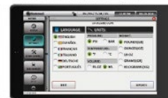
Settings Screen allows the user to select a default language, units, temperature, volume and weight measurement