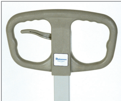
Three position ergonomic hand lever controls the hydraulic system with the handle in any position