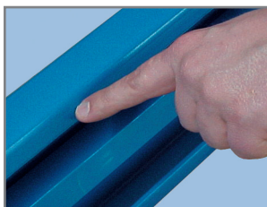
Formed fork for added strength and durability