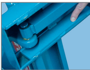
Steel reinforced plate strengthens frame and keeps forks parallel