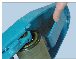
Formed steel entry slide diverts debris and guides forks into pallet